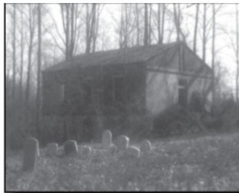
A photo of the Mount Olivet church/school from the early 1970s.

A cleanup of the church cemetery was undertaken in 2004, and news clippings on that will be attached to the final version of this document. The picture below is from the August 2009 Township Newsletter.