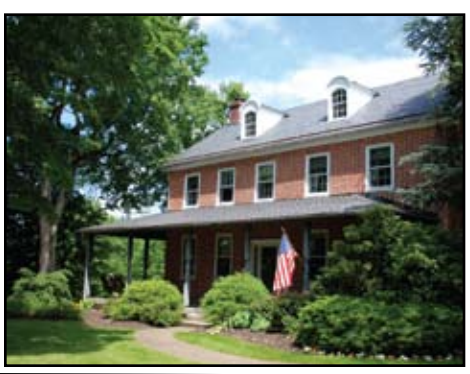
Franklin Township Newsletter February 2010