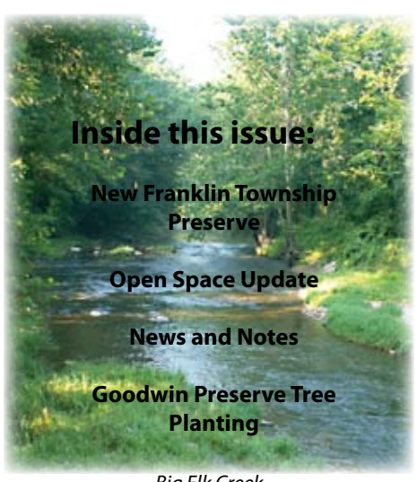
Big Elk Creek

Franklin Township Newsletter P. O. Box 118 Kemblesville, PA 19347