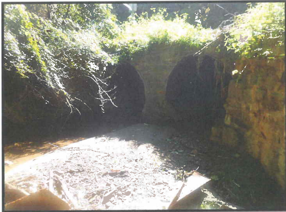
Structure profile looking upstream