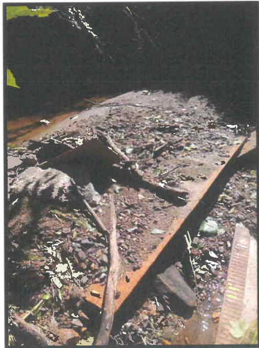
Sediment deposit on downstream side

Clay Creek Road Over Trib E Br White Clay Creek